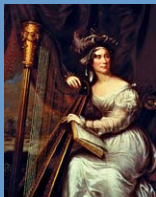
Louisa Catherine Adams 1775 - 1852

Louisa Catherine Adams was the nation's only foreign born first lady. She was the wife of our sixth president, John Quincy Adams.